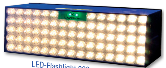
LED-Flashlight 300 white